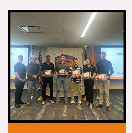
Team Dunkin' Donuts