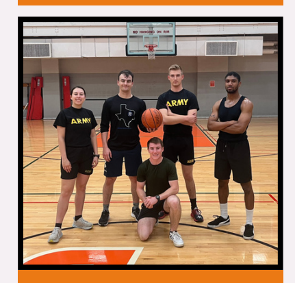
Team Dunkin' Donuts wins the game!