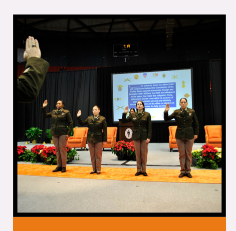
Newly Sworn-In Second Lieutenants