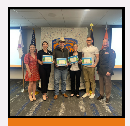
Best Mentor Awardees