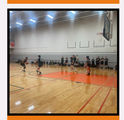
The final game in action