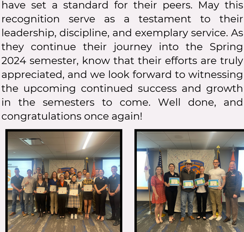
Top Female ACFT Awardees