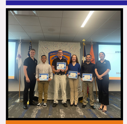
The Team Player Awardees