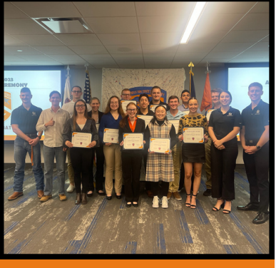
Push-Up Crew Awardees