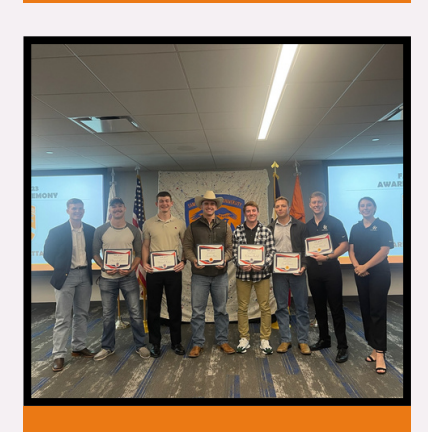
Top Male ACFT Awardees